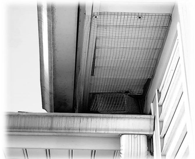
New critter proofing

Met with plumbers to assess ejector pump problems. Contacted ejector pump vendor for maintenance contract. Contracted with Baystate Wildlife for an eviction and exclusion of raccoons and squirrels in TCS ceiling (photo below). Installed one-way doors, mesh, flashing, and foam to allow animals only an option to go out.