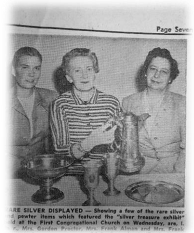
(photos) The newspaper clipping is dated 1957, and shows some of the silver pieces donated when the Village Church of Dorchester merged with FCC of Milton. The second image is from March 2021, showing the pitcher and cups, which are in the narthex.