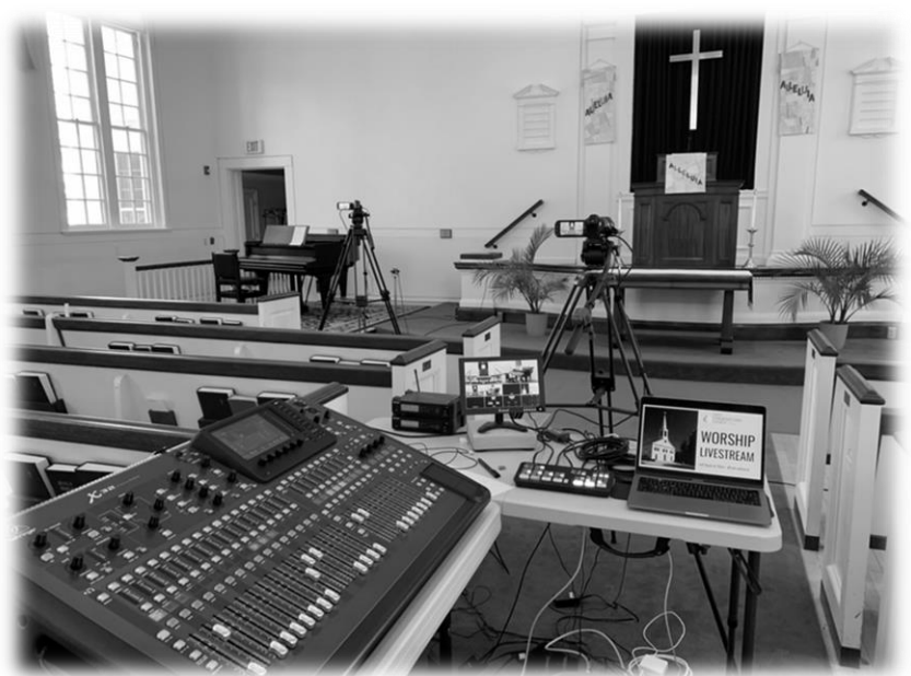
(above) When in-person worship was cancelled, the AV team streamed the 10 a.m. service from the sanctuary floor.